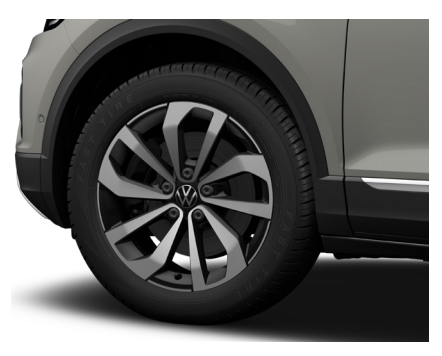
OPTIONAL ON STYLE

rolling resistance tyres 7J X 17 Tyres: 215/55 R17