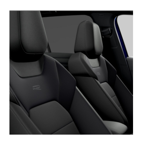
"Nappa Carbon Style" leather Black/Carbon (EM) Optional on R-Line Models