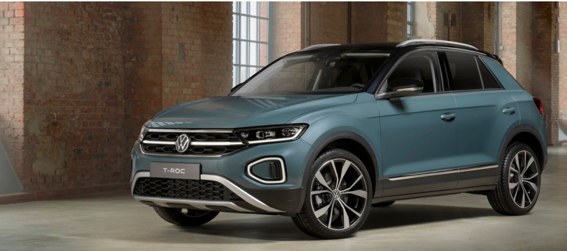
Note: The above image shows Style with optional 19" Misano Alloys