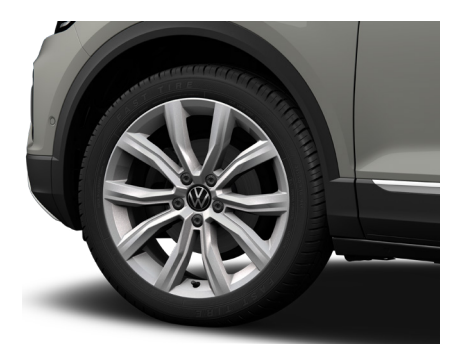
OPTIONAL ON LIFE, EDITION 75 & STYLE

17" Johannesburg alloy wheels with low rolling resistance tyres 7J X 17 Tyres: 215/55 R17