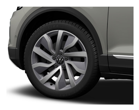
OPTIONAL ON STYLE

18" Portimao alloy wheels 7J X 18 Tyres: 215/50 R18