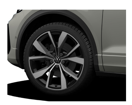
OPTIONAL ON STYLE & R-LINE MODELS

18" Portimao alloy wheels 7J X 18 Tyres: 215/50 R18