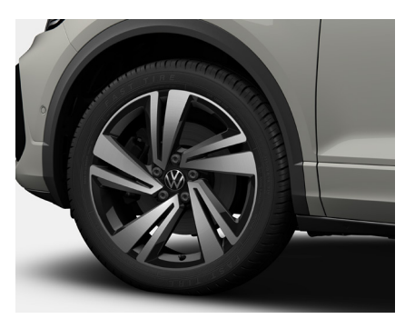
OPTIONAL ON R-LINE MODELS

19" Misano alloy wheels 8J x 19 Tyres: 225/40 R19