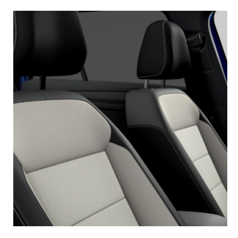
"Deep Iron Grey" ArtVelours cloth Storm Grey (XI) Standard on Style