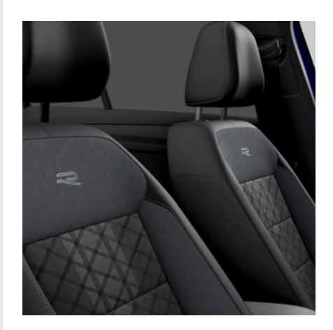
"Lava Stone Black" R-Line cloth Flint Grey/Black (OC) Standard on R-Line Models