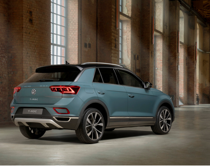
Note: The above image shows Style with optional 19" Misano Alloys