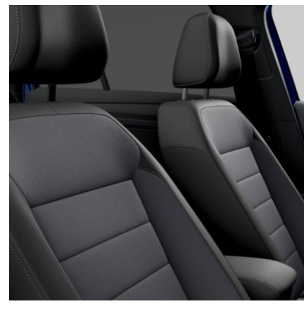
"Vienna" leather Platnium Grey/Black (LE) Optional on Style