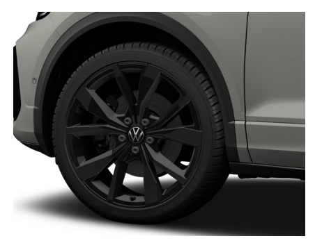
OPTIONAL ON STYLE & R-LINE 19" Misano alloy wheels in black 8J x 19 Tyres: 225/40 R19

18" Nevada alloy wheels in black 7J X 18 Tyres: 215/50 R18