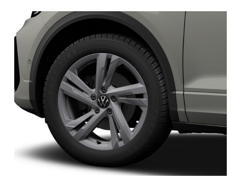
STANDARD ON R-LINE MODELS 17" Valencia alloy wheels with low

18" Grange Hill alloy wheels with low rolling resistance tyres 7J X 17 Tyres: 215/55 R17