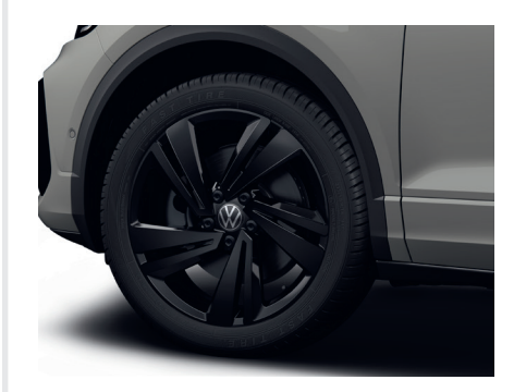
STANDARD ON STYLE & R-LINE WITH OPTIONAL BLACK EXTERIOR PACKAGE

The addition of optional extras may result in the vehicle increasing in Co2 g/km and therefore, attracting a higher rate of VRT than described in this product guide. For your exact configuration value, both Co2 g/km and RRP, please visit volkswagen.ie configurator.