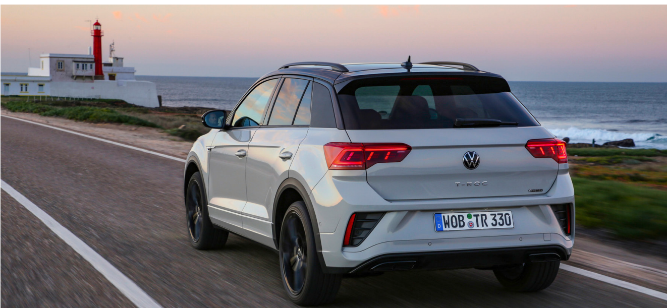
Note: The above image shows optional IQ.Light and Black Style Package