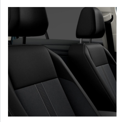
"Pewter Matte" cloth Titan Black/Ceramique (FJ) Standard on Life and Edition 75