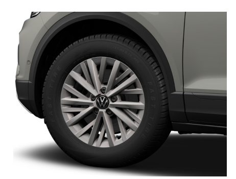
STANDARD ON LIFE 16" Chester alloy wheels with low rolling resistance tyres

The addition of optional extras may result in the vehicle increasing in Co2 g/km and therefore, attracting a higher rate of VRT than described in this product guide. For your exact configuration value, both Co2 g/km and RRP, please visit volkswagen.ie configurator.